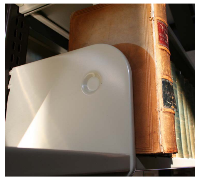
Light damage to leather binding

causes the molecules in the dye to vibrate more quickly, bump into each other like a demolition derby, and change their shape. The light hitting and reflecting off these new molecules changes the speed of the wavelength and thus the color the eye perceives in relation to the dye changes. The general term for this process is photochemical deterioration.