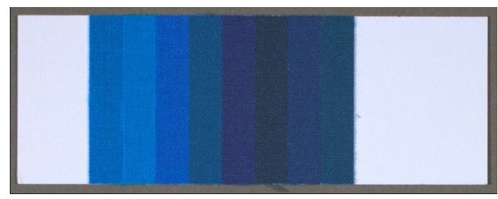
Blue Wool Card

To demonstrate the degree of fading caused by the intensity of light in a particular location, cover half of the card with a light-blocking material to protect it completely from light damage (or cut the card up into strips reserving one as a control). Note the date and set out the Blue Wools in the desired location. Check periodically (every couple of weeks) to determine how long it takes the various samples to fade. Since the sensitivity of the first few samples on the card corresponds to light sensitive materials such as watercolors and textiles, the results will give you a general idea of the amount of damage you might expect if materials were exhibited for the same period of time at the current light level in that location.